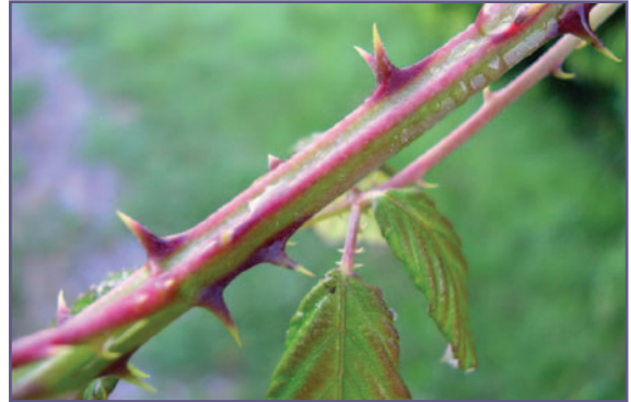
Figure 5. Blackberry thorns.

New blackberry growers should consider experimenting with all three types to learn which grows and fruits best in their area, and which they prefer to maintain. The harvest season for commercial blackberries can be extended by growing all three types (Table 1).