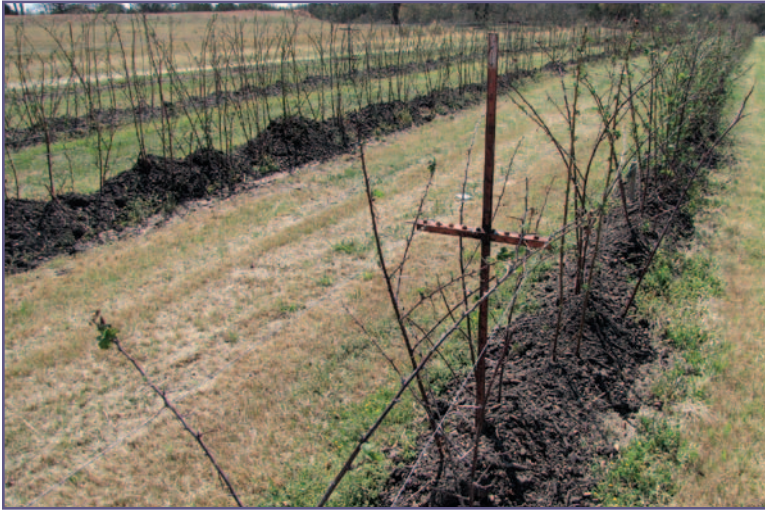
Figure 7. A supported hedge-row training system, with T-posts supporting two parallel wires 18 inches apart and about 30 inches high.

ports simple to make it easier to remove dead floricanes.