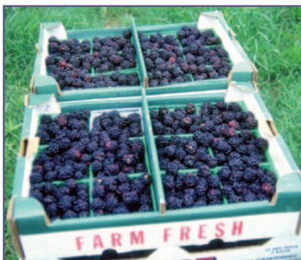
Figure 12. Blackberry flats.