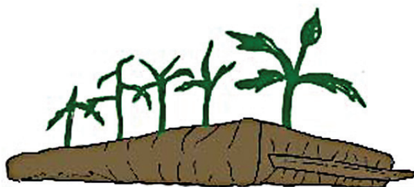
A "tube" or bag garden is an easy method to grow vegetables.

The seed should be started in a warm area that receives sufficient sunlight about 4 to 8 weeks before you plan to transplant them into the final container. Most vegetables should be transplanted into containers when they develop their first two to three true leaves. Transplant the seedlings carefully to avoid injuring the young root system. (See Table 2 for information about different kinds of vegetables.)