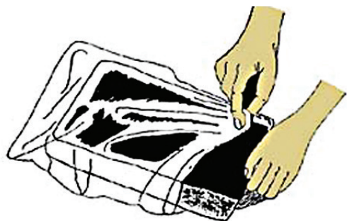
Covering the seed flat with a clear plastic bag will hasten germination.