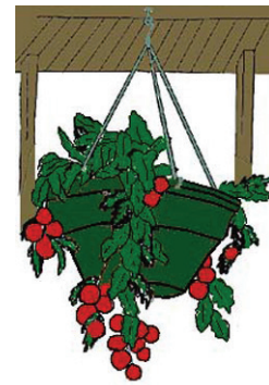
Small fruited tomato varieties make excellent hanging baskets.

Variety selection is extremely important. Most varieties that will do well when planted in a yard garden will also do well in containers. Some varieties of selected vegetables which are ideally suited for these mini-gardens are indicated in Table 1.