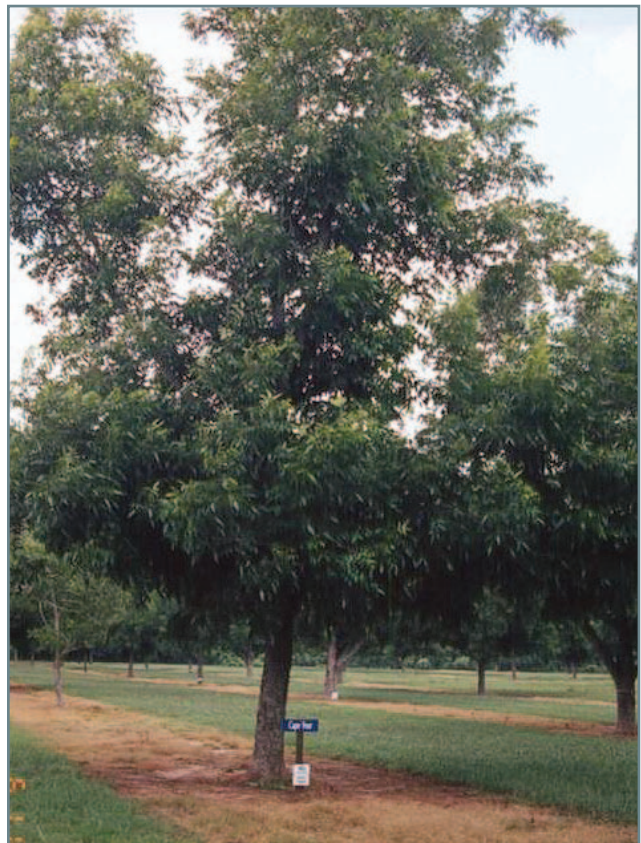
Figure 10. A “sod and strip” orchard floor.

Although some Texas growers graze sheep, cattle, goats, and other animals in improved orchards, it is generally not recommended because livestock can compact the soil, damage young trees, and interfere with irrigation, spraying, and harvesting.