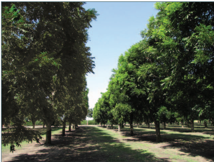
Figure 16. Well-managed pecan orchards on good sites can produce from 1,000 to 2,000 pounds of nuts per acre per year.

Well-managed orchards on good sites can produce from 1,000 to 2,000 pounds per acre per year (Fig. 16). Pecan production