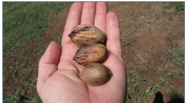
Figure 7. Nuts from three pecan varieties. From the top down: Lipan, Pawnee, and Kanza.

For more information about pecan varieties, see the Texas Pecan Handbook , which is available from the Texas A&M AgriLife Bookstore at https://agrillifebookstore.org/ .