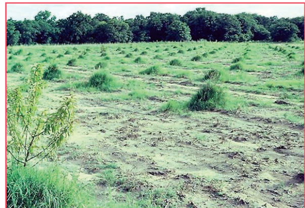
Figure 6. Lack of weed control causing poor tree survival, reduced growth, and orchard failure.

Weed control is critical in the first year; if left unchecked, weeds can drastically reduce the first year's growth. Most weeds remove water and nutrients from the soil more aggressively than can the newly set peach trees. Often these small trees can be seen standing in lush green grass with the telltale red spots of nitrogen deficiency on their leaves (Fig. 6). The trees will grow much bigger if weeds are controlled during the first year.