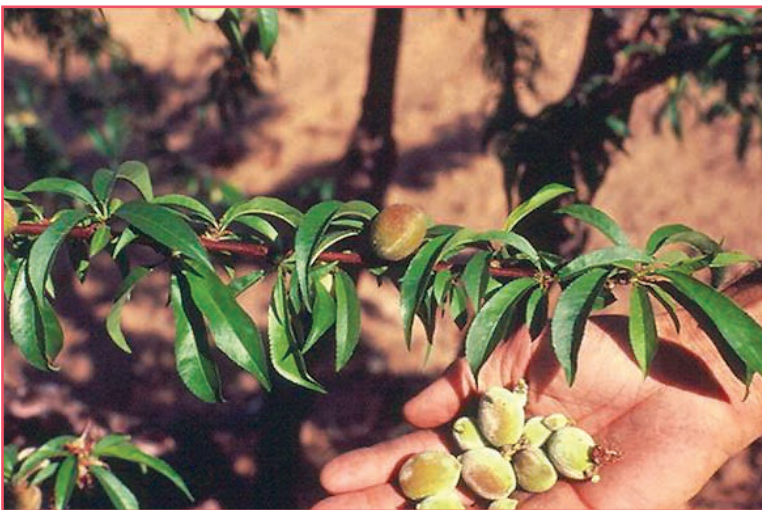
Figure 10. Hand-thinning of developing fruit.

Mechanical thinning by shakers can be successful if done carefully. The major drawbacks are that the shakers tend to damage the trees if used improperly, and that growers must wait for the fruit to get large enough to be