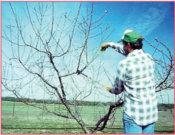
Figure 9. Peach tree pruning.