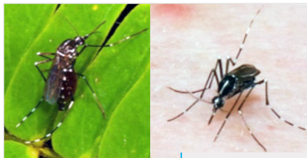
Aedes albopictus feeding

Since 2002, the most important mosquito-transmitted disease in Texas has been West Nile virus. West Nile virus is carried by a different mosquito, the southern house mosquito, Culex quinquefasciatus . Unlike the Culex mosquitoes which fly only at night, Aedes mosquitoes are active throughout the day and into the evening. For this reason, it is critical to protect against mosquito bites both day and night.